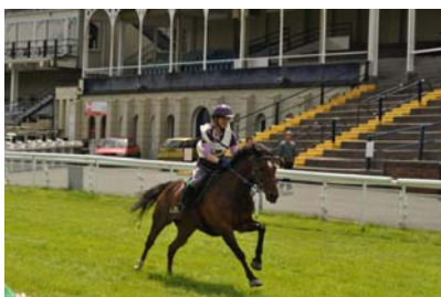
Racing finish at Ludlow 2009!

Well its finally been decided. After an informal meeting over coffee, the selection committee and our new Chef have come up with the teams. A number of riders have been working towards these competitions and have successfully made it onto the team.