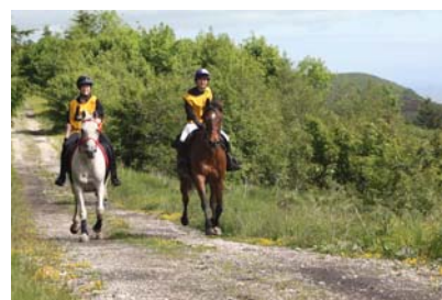
Spot the 3rd amigo!!!!!!