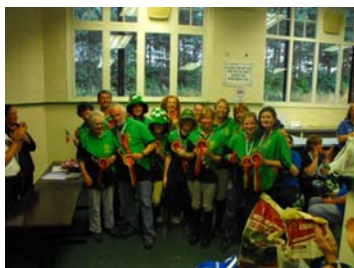
2009 Winning Nation!!!!!!

Last year saw a first for Ildra, outright winners taking both the Home International and Celtic Challenge trophies home. Anyone who was there will tell you that it was a great experience not only for those riders but the crews and supporters. If you would like to be a part of this