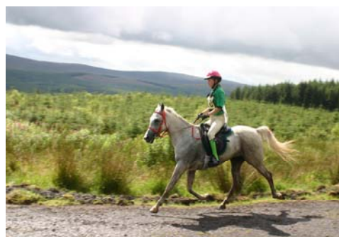
What a view!

If you are fed-up with receiving a rosette why not take a loyalty card instead.