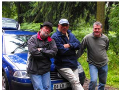
The Three Amigos!