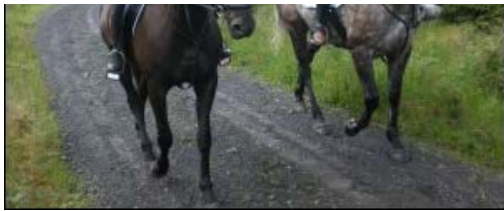
Article: 24th June 2008